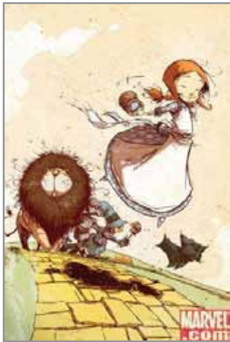
THE WONDERFUL WIZARD OF OZ

9:30PM-2AM-HEROES VS. VILLAINS COMIC-CON DANCE PARTY Face painting, a costume contest, go-go heroes and guys in spandex gear and super-hero costumes! $10 cover ($3 off with Con Badge). RICH'S NIGHTCLUB (OFF-SITE), 1051 UNIVERSITY AVE. (619) 578-9055