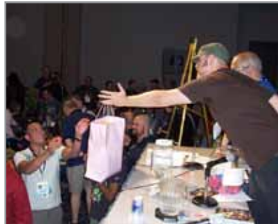
PRIZE GIVEAWAY AT THE PRISM MIXER