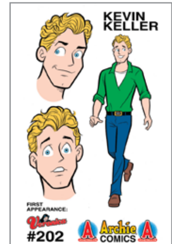
ARCHIE COMICS' KEVIN KELLER