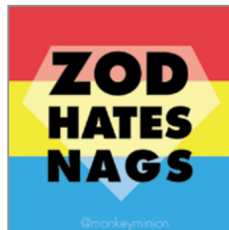
GRAPHIC BY LORI MATSUMOTO & DANE AULT

1-2PM—WESTBORO BAPTIST CHURCH PICKETS COMIC-CON The most evil super villains of the real world appear to picket Comic-Con for "worshipping idols"! PRISM cautions you do not under any circumstances engage in violence against them... but