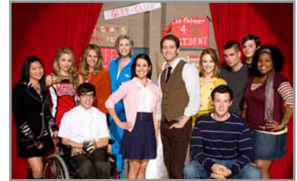
THE CAST OF GLEE

1:30-2:30PM—GLEE One year after the cast and creators of Glee came to Comic-Con for the first time, the show has exploded with blockbuster ratings, number-one albums and a sold-out concert tour. Get an exclusive first look at what's in store for season 2 from executive producers Ryan Murphy and Brad Falchuk, along with stars Chris Colfer , Amber Riley, Jenna Ushkowitz, Kevin McHale, Mark Salling, Heather Morris, and Naya Rivera, as they share some never-before-seen footage, spill behind-the-scenes secrets, and take questions from the crowd. BALLROOM 20