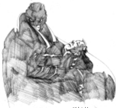
Midnighter ©2000 Wildstorm