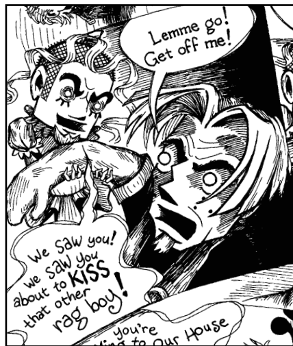
From Stitch ©Tommy Kovac