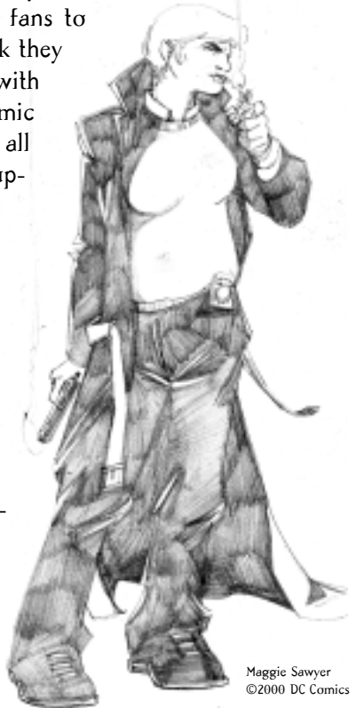
Maggie Sawyer

Note: Gender identity and sexual orientation being as fluid as they are, we have included the “Identification” tag at the end of certain entries only when specifically asked to by the creators themselves.