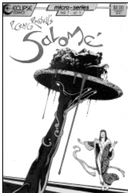
P. Craig Russell's Salomé.

respected and award-winning artists, and the most high-profile, openly gay creator in the business. Some of Craig's favorite work includes Sandman 50 "Ramadan," his first in a series of works with Neil Gaiman — the second is "One Life Furnished in Early Moorcock." Other favorites include "Isolation & Illusion" in Epic 14 (1981), and "Human Remains," included in Clive Barker's Tapping the Vein 1 from Eclipse Comics. Recent work has included stories in various Batman titles for DC and Star Wars titles for Dark Horse.